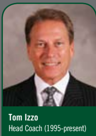
Tom Izzo Head Coach (1995-present)

In his 14th year directing the Spartan program, head coach Tom Izzo has compiled an impressive list of accomplishments, including one NCAA National Championship, four regular-season Big Ten Championships, two Big Ten Tournament titles, four Final Four appearances, four National Coach of the Year awards and a Big Ten-best 11 straight NCAA Tournament appearances.